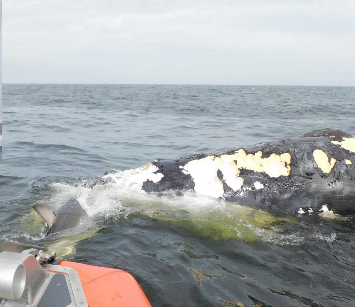
STA Oak Island & CGC Nathan Bruckenthal with UNCW assist with dead right whale. FEB 2021

Images collected under Permit #18786-06, Exp. 31DEC22